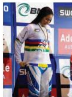
3. Mariana Pajon