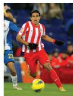
2. Radamel Falcao